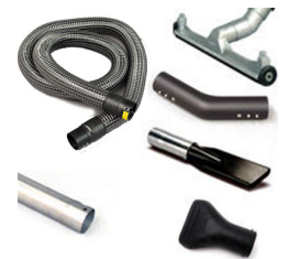
ACCESSORY PACK IMAGE