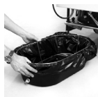
DISPOSABLE PLASTIC BAG