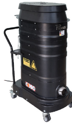
WS 2220 M ZONE 22