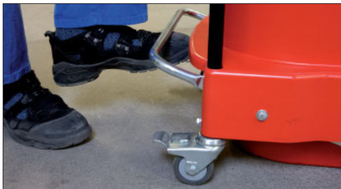
Emptying using foot pedal