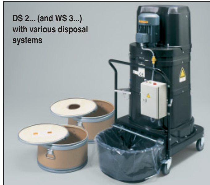
DS 2... (and WS 3...) with various disposal systems