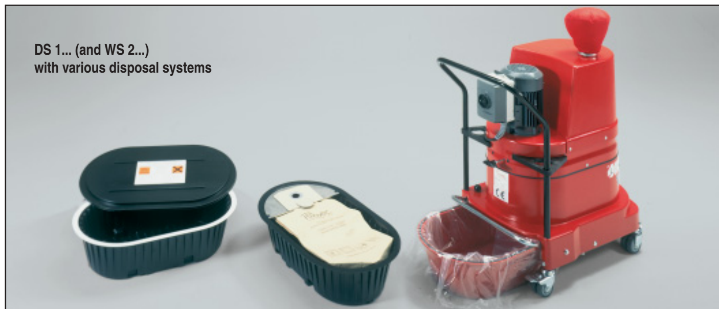
DS 1... (and WS 2...) with various disposal systems