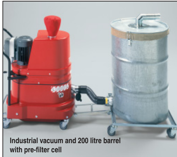
Industrial vacuum and 200 litre barrel with pre-filter cell