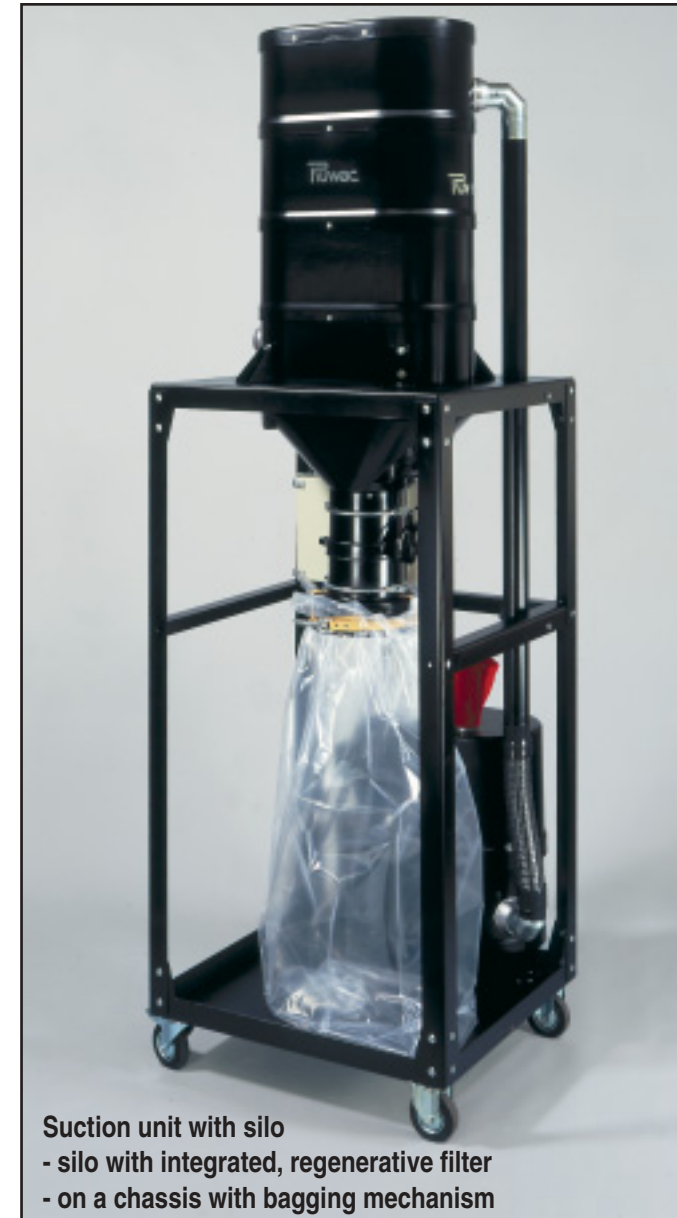
Suction unit with silo - silo with integrated, regenerative filter - on a chassis with bagging mechanism