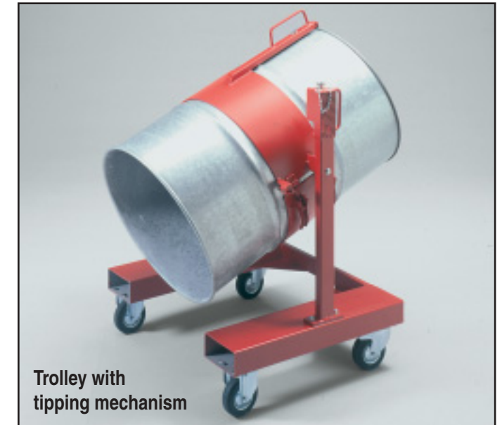
Trolley with tipping mechanism