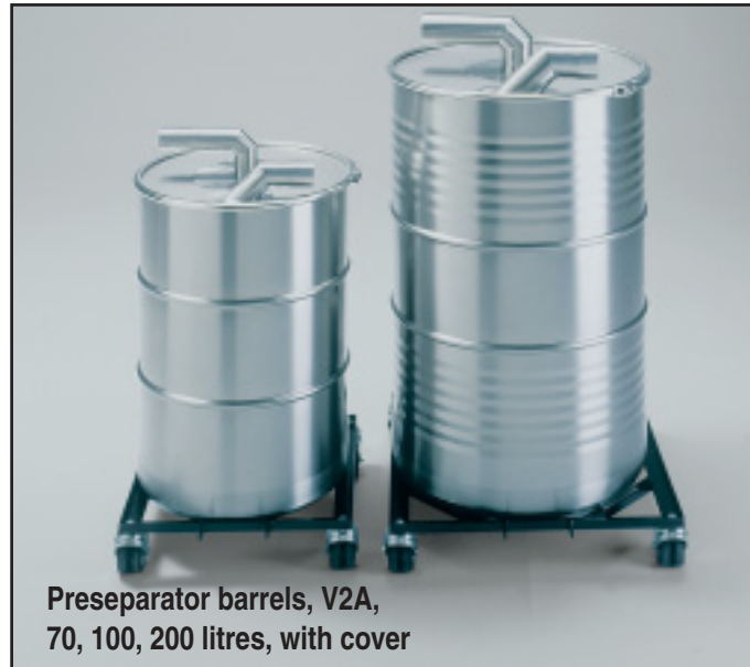
Preseparator barrels, V2A, 70, 100, 200 litres, with cover