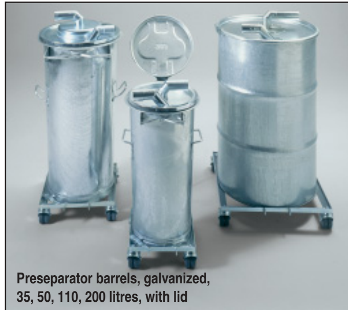
Preseparator barrels, galvanized, 35, 50, 110, 200 litres, with lid

When positioned between the suction point and suction unit, preseparators deposit all sorts of vacuumed materials, thus relieving the filter. Whether the material is dry, damp or wet, it will be gathered or separated, disposed of or recycled in the most diverse customised preseparators or disposal systems.