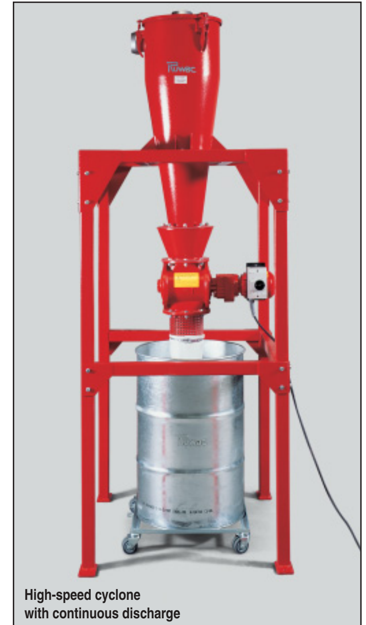
High-speed cyclone with continuous discharge